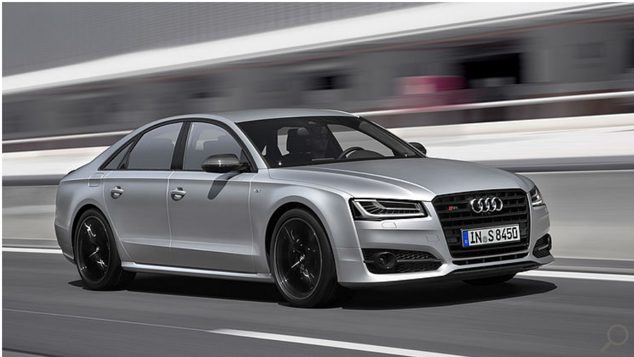
A highly automated version of the A8 will be available in 2017.

If you look at the current A4 or Q7, they already represent Level 2 automation which offers a high level of comfort for the driver. Next year, the new A8 will be the world's first car with true Level 3 automation. On congested motorways, it will be able to drive itself at up to 40 miles per hour (60 kilometers per hour). When the driver needs to take over the steering wheel, there will be a proper handover. The driver always has to be in the loop – similar to a pilot in an airplane. That's why we call it piloted driving .